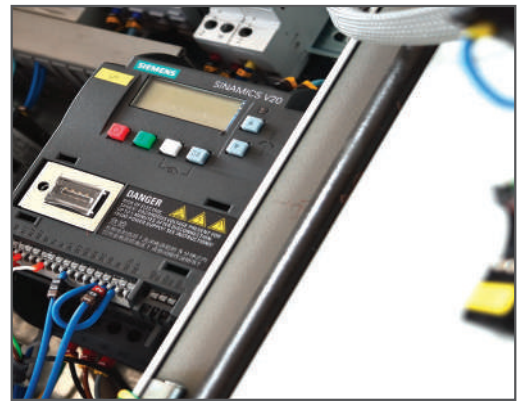
SIEMENS V20 INVERTER

SIEMENS V20 Inverter; Loading plate: 1500 mm; Maximum loading weight: 1200 kg; External potentiometer for turntable speed adjustment; Industrial footswitch; Stop at 0 position; Powder coating; Braked turntable at the end of the cycle; 2 years warranty.