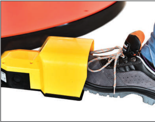
PIZZATO -INDUSTRIAL FOOTSWITCH FOR CYCLE'S MANAGEMENT.