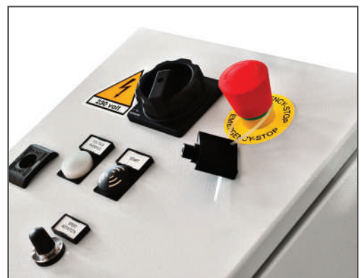
EXTERNAL POTENTIOMETER FOR TURNTABLE'S SPEED ADJUSTMENT